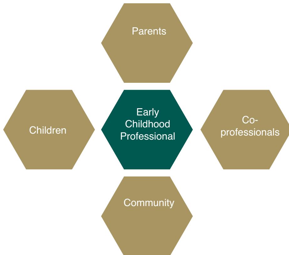
Figure 1: Range of contexts in which early childhood educators work